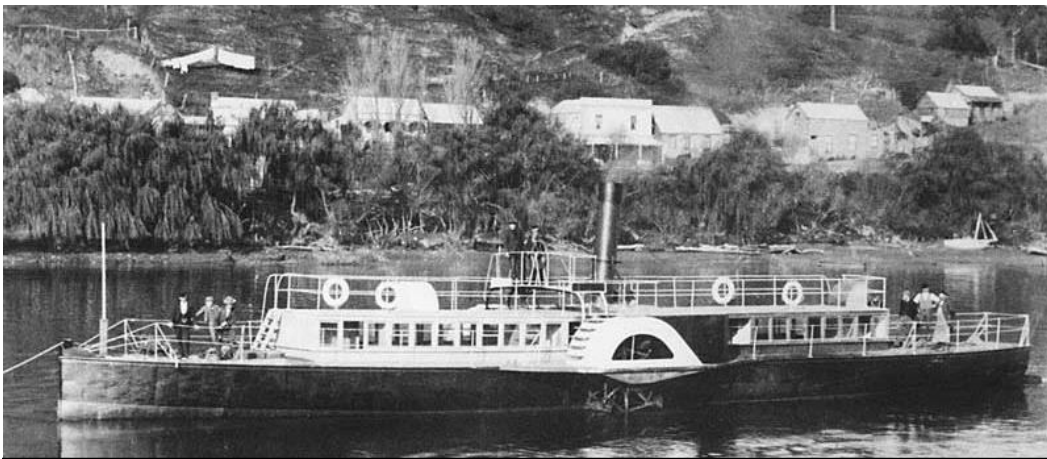
PS Waimarie moored on the Whanganui River – approx. 1900

From the first moment to the time we returned the scenery was as magnificent as the day turned out to be. With the morning being so still, the calm parts of the river in particular were mirror flat – the reflections so clear until they were shattered by the wake of the boat. Clusters of ducks with ducklings – some still little bundles of yellow fluff watched in amusement as the large green machine and its passengers, all clad more like eskimos, zoomed by.