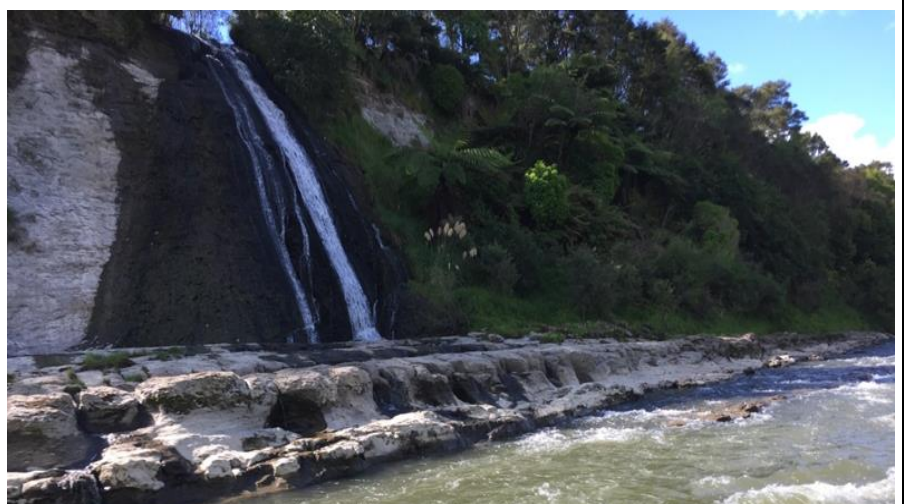
A clear example of how the 'original' river level has dropped since the Hydro station was built

All had their gear stowed in screw top buckets that were well tied down in the kayak as we'd been told at the start – it's 240 kms from Taumarunui to Whanganui and 240 rapids; each of them with a name but due to river levels being in their spring flow levels, many of the rapids were 'lost' in the